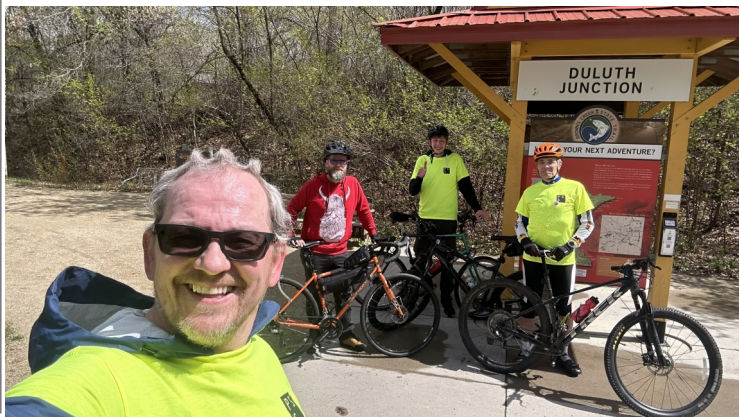
Rajd Rowerowy M.B. Królowej Polski i Konstytucji 3