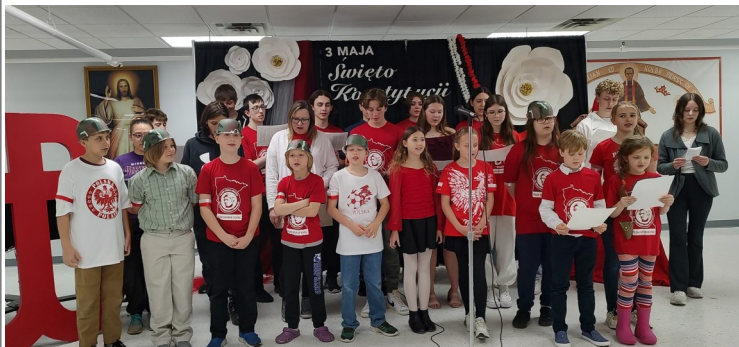
Akademia z okazji Święta Konstytucji 3 Maja w PSS

Duchu Święty, odnow swoje cuda w naszych czasach, jak podczas nowej Pięćdziesiątnicy, i spraw, aby ta Archidiecezja, zjednoczona na modlitwie wokół Maryi, Matki Jezusa, i prowadzona przez św. Piotra, mogła szerzyć Królestwo Boskiego Zbawiciela, Królestwo prawdy, sprawiedliwości, miłości i pokoju. Amen. Święty Pawle, nasz wielki patronie misji, módl się za nami!